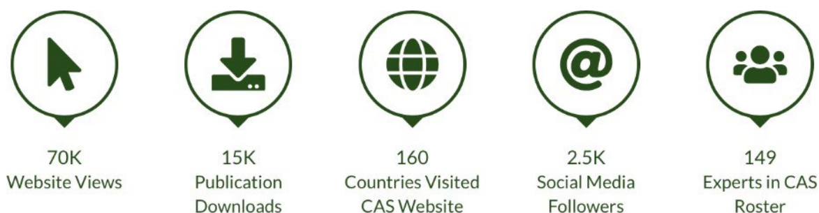
Figure 3 Annual Snapshot: How is CAS engaging online?

The Secretariat followed closely the One CGIAR transition effort, adaptively managing its effort to address requests and new-arising opportunities. The Secretariat authored briefs for incoming One CGIAR leadership, and regularly reported to both SIMEC and Assurance and Oversight Committee during the year, and periodically to System Board. Furthermore, the Secretariat engaged in substantive interactions with the Transition Program Management Unit (TPMU); the chief area of CAS Secretariat's interaction with TPMU related to its effort to assign an appropriate name to CAS Secretariat under the One CGIAR operational structure. As of this writing, this name is designated as the Independent Advisory and Evaluation Service .